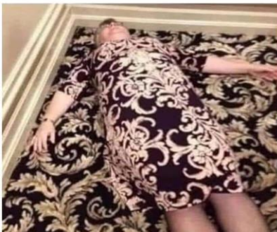
When you have 7 people at Thanksgiving in Oregon and the cops show up...

Eugene RC Aeronauts PO Box 26344 Eugene, OR 97402 www.eugenerc.org